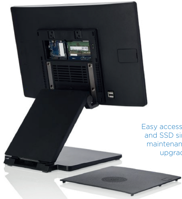
Easy access to RAM and SSD simplifies maintenance and upgrades