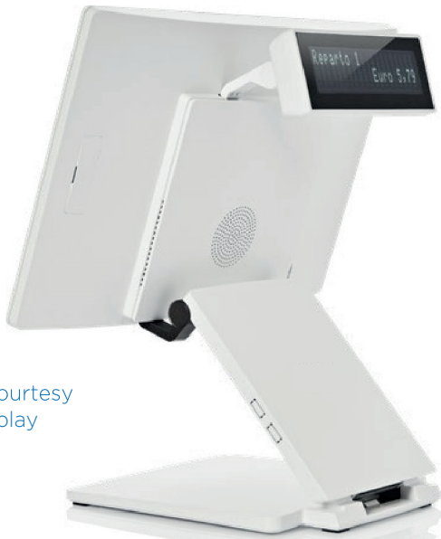
VFD Courtesy Display

The external I/O Box provides unmatched versatility in installation, enabling a more agile management of peripherals to ensure consistently organized and efficient cashier stations