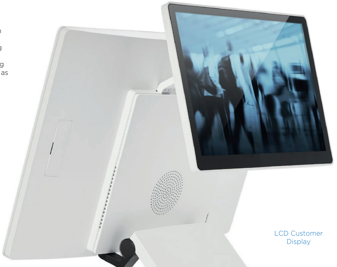
LCD Customer Display

The new Mazic CL can incorporate the VFD courtesy display along with various types of LCD displays, including touchscreen versions, as well as smart card, magnetic card, and fingerprint readers.